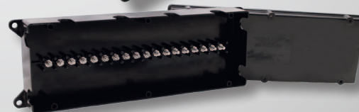
PH4450 18 pole junction box

*fuses not included with fused junction boxes