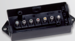
PH1053 7 pole junction box