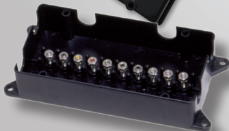
PH310 10 pole junction box PH3320 12 pole junction box