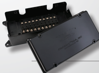
PH3277 10 pole fused junction box